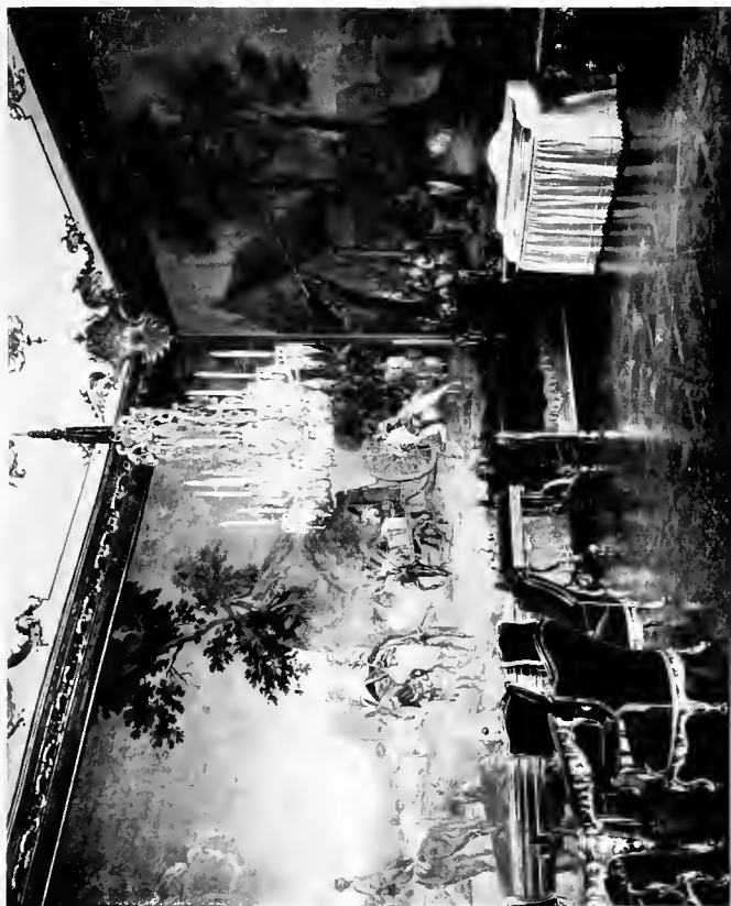
THE ROOM IN WHICH THE DUKE OF REICHSSTADT DIED, IN THE CASTLE OF SCHONBRUNN, NEAR VIENNA